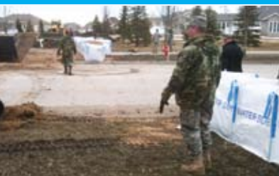
Deployment of The Big Bag System in Fargo, USA

It took 174 army personnel, 24 trucks and 3 boats 24 hours to deploy 10,000 sandbags during the recent floods in Skibbereen Co.Cork in November 2009. This equates to 4176 man hours. The Big Bag System can be deployed in similar circumstances in approximately 1 hour with 2 people.