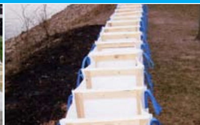
Big Bag System is easily assembled