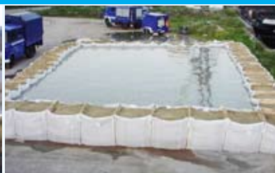
Big Bag System onsite demonstration